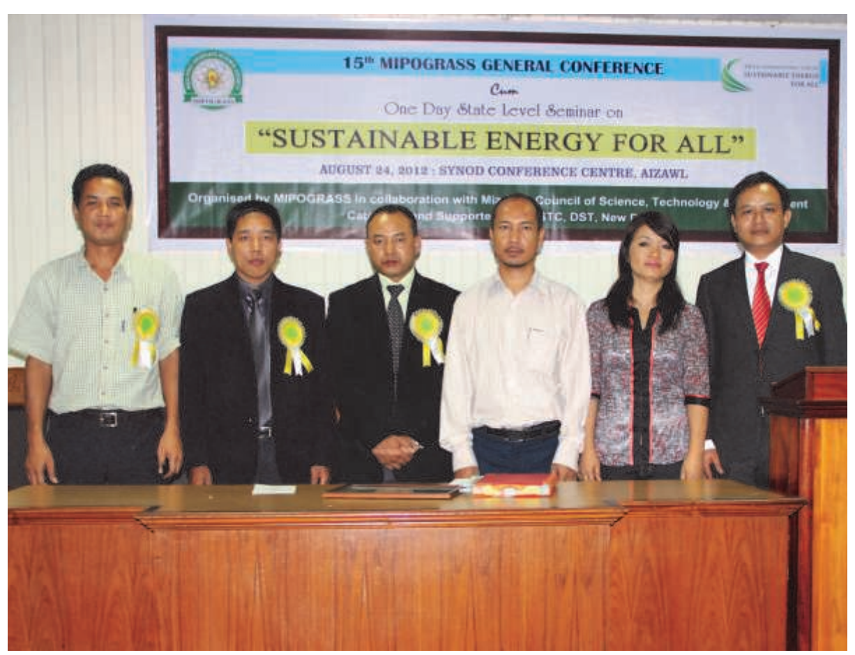
[2012 General Conference-a General Secretary Report]

À tâwp berah chuan vawiin thlenga MIPOGRASS tluang taka min kaihruaitu kan Pathian chungah lâwmthu kan sawi a; Mizoram in science lama hma a sâwn zêl theih nan member-ten theihtâwp i chhuah zêl ang u.