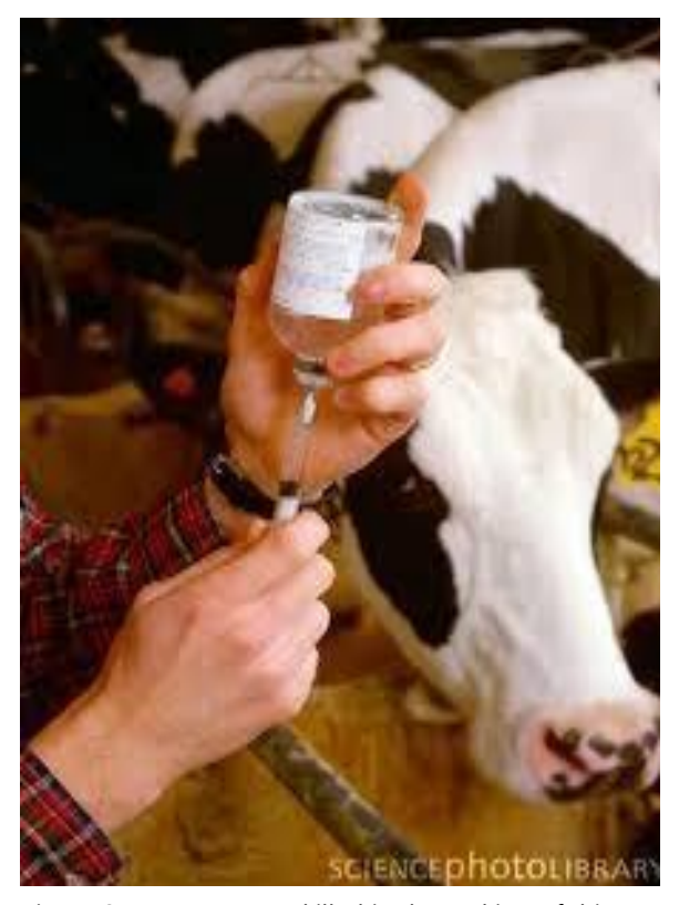
Figure 2. No cows were killed in the making of this drug, EtB, other than pricking with a syringe needle; in fact, it saved them.

On the imaginative side, I wonder if such a mutagenic drug had been applied for decades (Fig. 2), why mutant cows have not been roaming the continent of Africa. To reiterate, EtBr was originally developed and had served as a drug of choice for the treatment of cattle trypanosomiasis for several decades. Although the obvious lack of existence of Supercow (as we have fictional Superman), or X-cow (for the counterpart of X-Men), or a cow of any sort re-