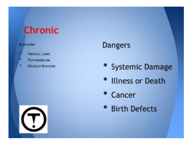
Figure 3. Some informed campaigns are just plain derogatory and lack empirical evidence such as this. Mercury, lead, and formalin are known highly toxic and poisonous chemicals. The same is not true for EtBr.

either positively or negatively with a cancer risk in humans are to be found in the medical literature (Fig. 3).