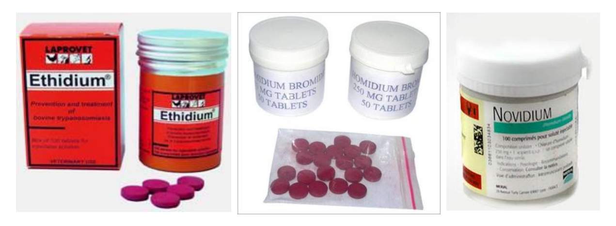
Figure 1. Different brands of EtBr, the same chemical of disrepute but that have saved countless lives of cattle and sheep from trypanosomiasis.

Ethidium brouhaha: exorcising the EtBr demon from wimpy researchers