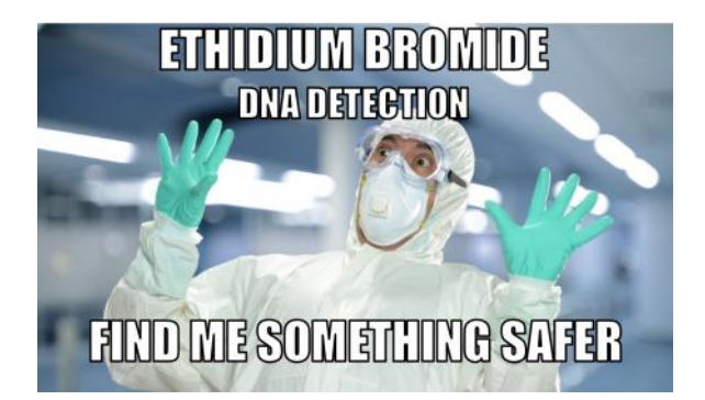
Figure 5. This ad entirely misses GelRed, which it is actually advertising.

In fact, Ward and Harper have carefully cautioned that even nitrile gloves are not safe for SYBR<sup>®</sup> Safe and its light sensitivity can be a problem while running a gel. They further suggest that "ethidium bromide or other nucleic acid binding dyes can be used as an alternative to SYBR<sup>®</sup> Safe".<sup>16</sup>