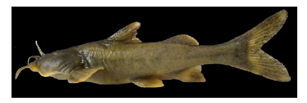
Figure 2. Glyptothorax indicus , 57.02 mm SL, PUCMF 1040, showing scattered black spot on caudal peduncle and caudal fin.