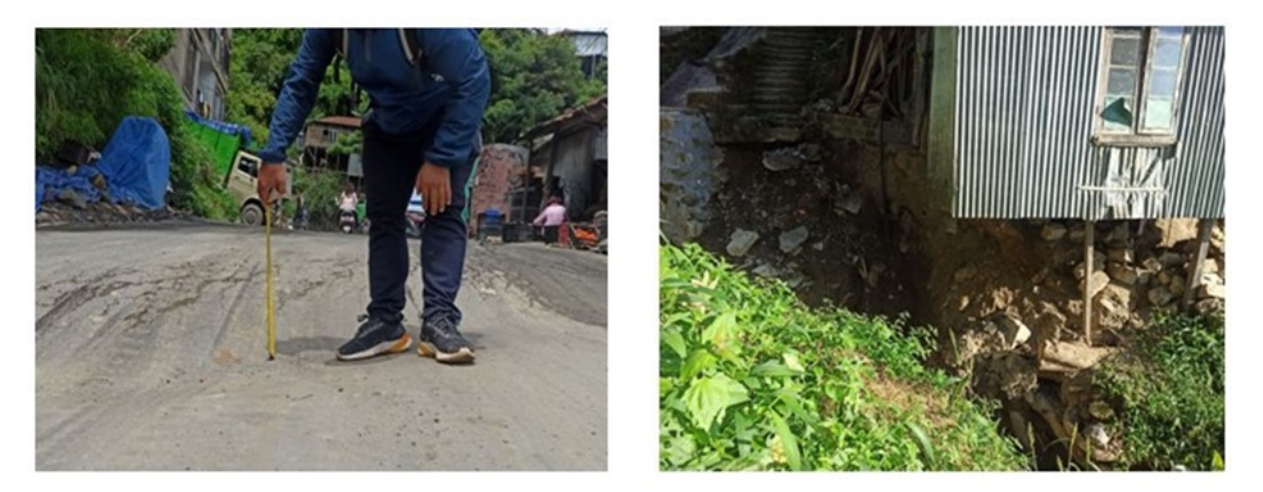
Figure 1: Field photographs of ground displacement at Zuangtui Area

during the wet season from the same two locations (Fig.2). The samples were kept in a sample bag so that soil moisture is not lost before testing in the laboratory. The geometry of the slope and slope angle was recorded for slope stability analysis using Limit Equilibrium Method (LEM).