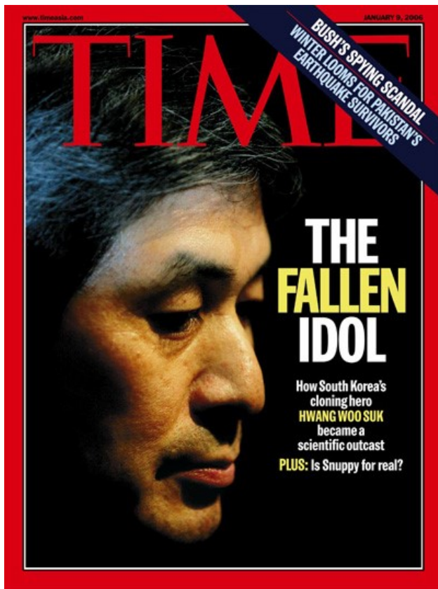
Figure 4 | The horribly humiliated Hwang.

working in a public position for 5 years after his dismissal and will receive only half of his retirement money. 45 The case was filed under criminal offences with the first court hearing on 12 May 2006 on three charges: embezzling 2.8 billion won [US$3 million]; committing fraud by knowingly using fabricated data to apply for research funds; and violating a bioethics law that prohibits the purchase of eggs for research. 36 In a court ruling in October 2009, he was sentenced to a two-year suspended prison, 46 and a three-year suspension from working. 47 He admitted before the court that he had directed fabrication (duplication) of images for the 2005 paper, that he gave research funds to certain Russian mafia figures for making a project to clone an extinct mammoth. 48