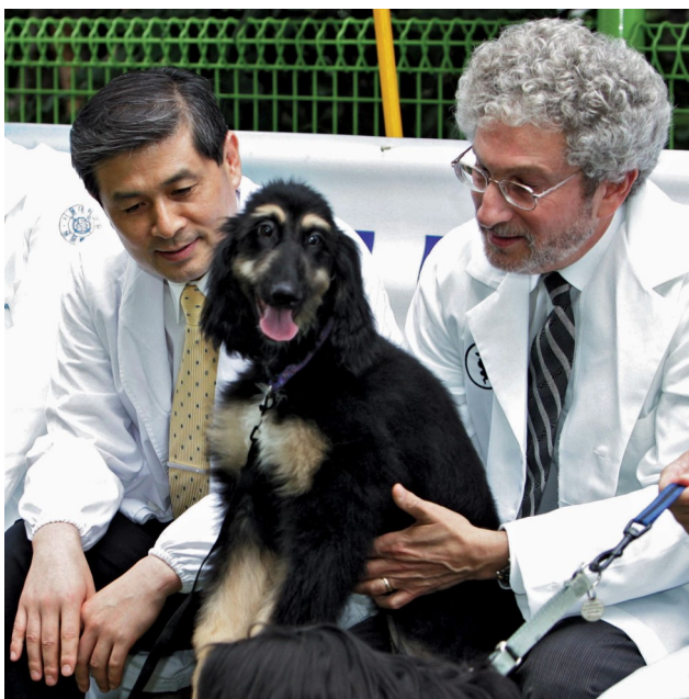
Figure 4 | Hwang Woo-Suk (left), Snuppy (centre) and Gerald Schatten during their happy times.

It was not a mere compliment when he announced the first clone of a dog, Snuppy, an Afghan hound, in 2005. When his team published the cloning result in the 4 August issue of Nature , 29 it