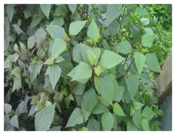
Figure 1. Ageratina adenophora (Asteraceae)

dures for the preparation of extracts from plant materials due to their ease of use, efficacy, and wide applicability. The solubility of phenolics is governed by the chemical structural features of the plant sample as well as the polarity of the solvents used. Plant materials may contain a range of chemically diverse phenolics varying from simple (e.g. phenolic acids, anthocyanins) to highly polymerized substances (e.g. tannins) in different quantities.<sup>4</sup>