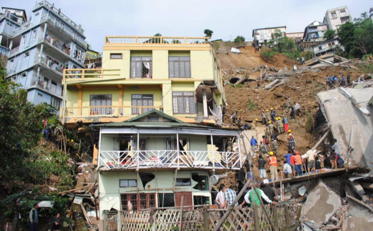
Figure 1. Site and extent of rockslide at Laipuitlang, Aizawl, on 11 May 2013.