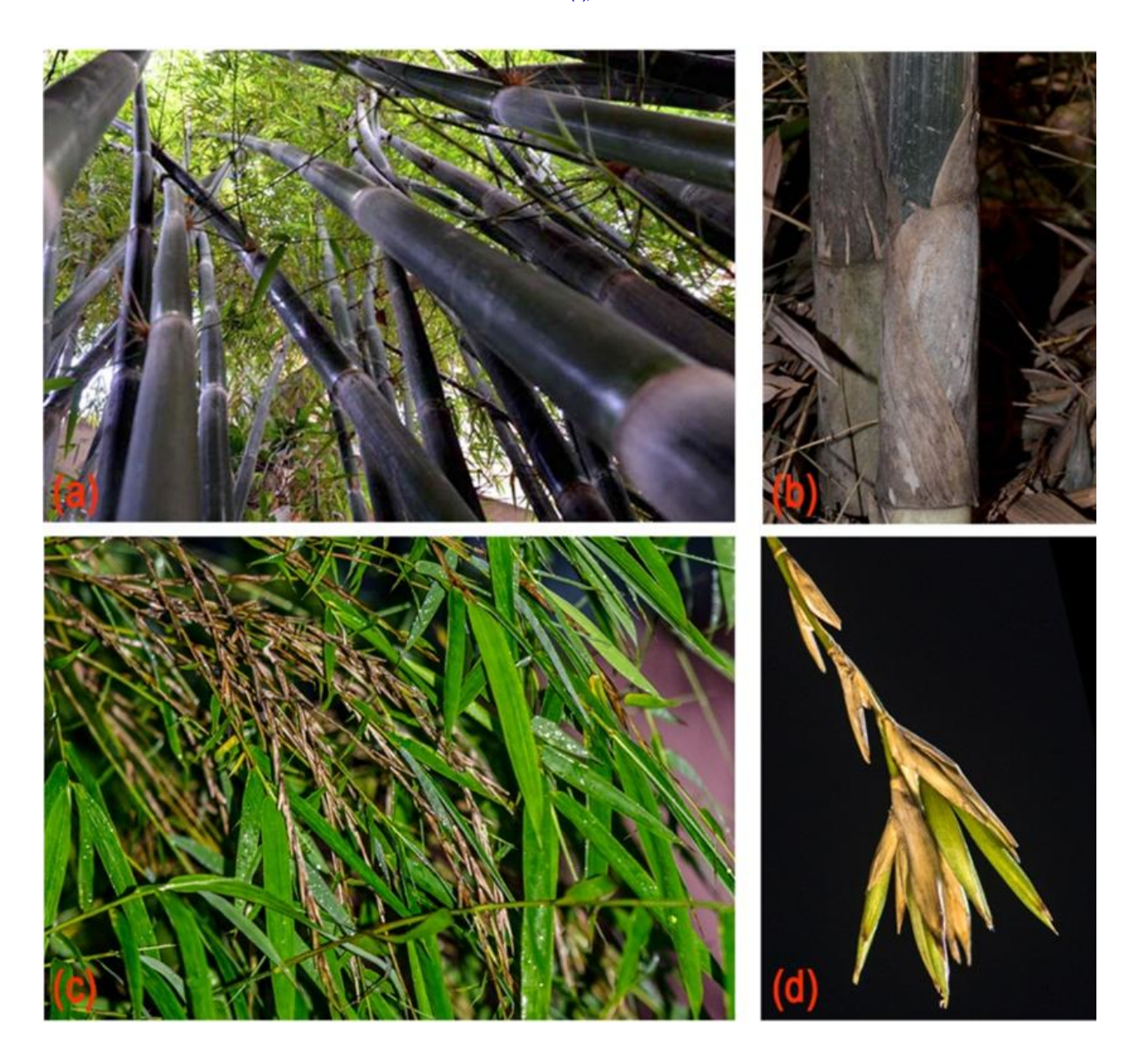
Figure 1 | Inflorescence in Bambusa mizorameana Naithani. (a) Clumps. (b) Culm sheath. (c) Initial stage. (d) Close-up of initial stage.