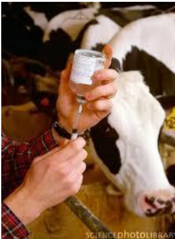
Figure 2. No cows were killed in the making of this drug, EtB, other than pricking with a syringe needle; in fact, it saved them.

On the imaginative side, I wonder if such a mutagenic drug had been applied for decades (Fig. 2), why mutant cows have not been roaming the continent of Africa. To reiterate, EtBr was originally developed and had served as a drug of choice for the treatment of cattle trypanosomiasis for several decades. Although the obvious lack of existence of Supercow (as we have fictional Superman), or X-cow (for the counterpart of X-Men), or a cow of any sort re-