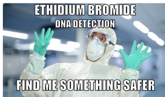
Figure 5. This ad entirely misses GelRed, which it is actually advertising.

In fact, Ward and Harper have carefully cautioned that even nitrile gloves are not safe for SYBR ® Safe and its light sensitivity can be a problem while running a gel. They further suggest that “ethidium bromide or other nucleic acid binding dyes can be used as an alternative to SYBR ® Safe”. 16