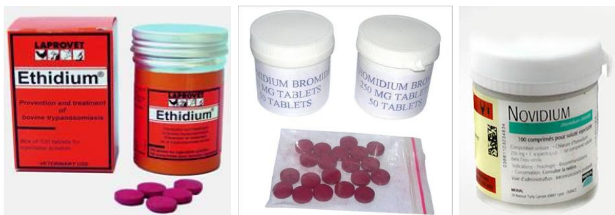
Figure 1. Different brands of EtBr, the same chemical of disrepute but that have saved countless lives of cattle and sheep from trypanosomiasis.

be proud to display it. It is the most widely used drug for cattle trypanosomiasis (Fig. 1), and most widely used nucleic acid stain that it is the most studied compound among the phenanthridines. There have been serious health concerns for its toxicity and mutagenicity in cultured cells. It is precisely for these reasons that it has earned a cohort of ill-reputed monikers such as toxic, genotoxic, mutagen, carcinogen, hazardous, and teratogen. This has created fear and furore in molecular laboratories all over the world, and coincidentally opens the floodgate for rival products to toot their own horn.